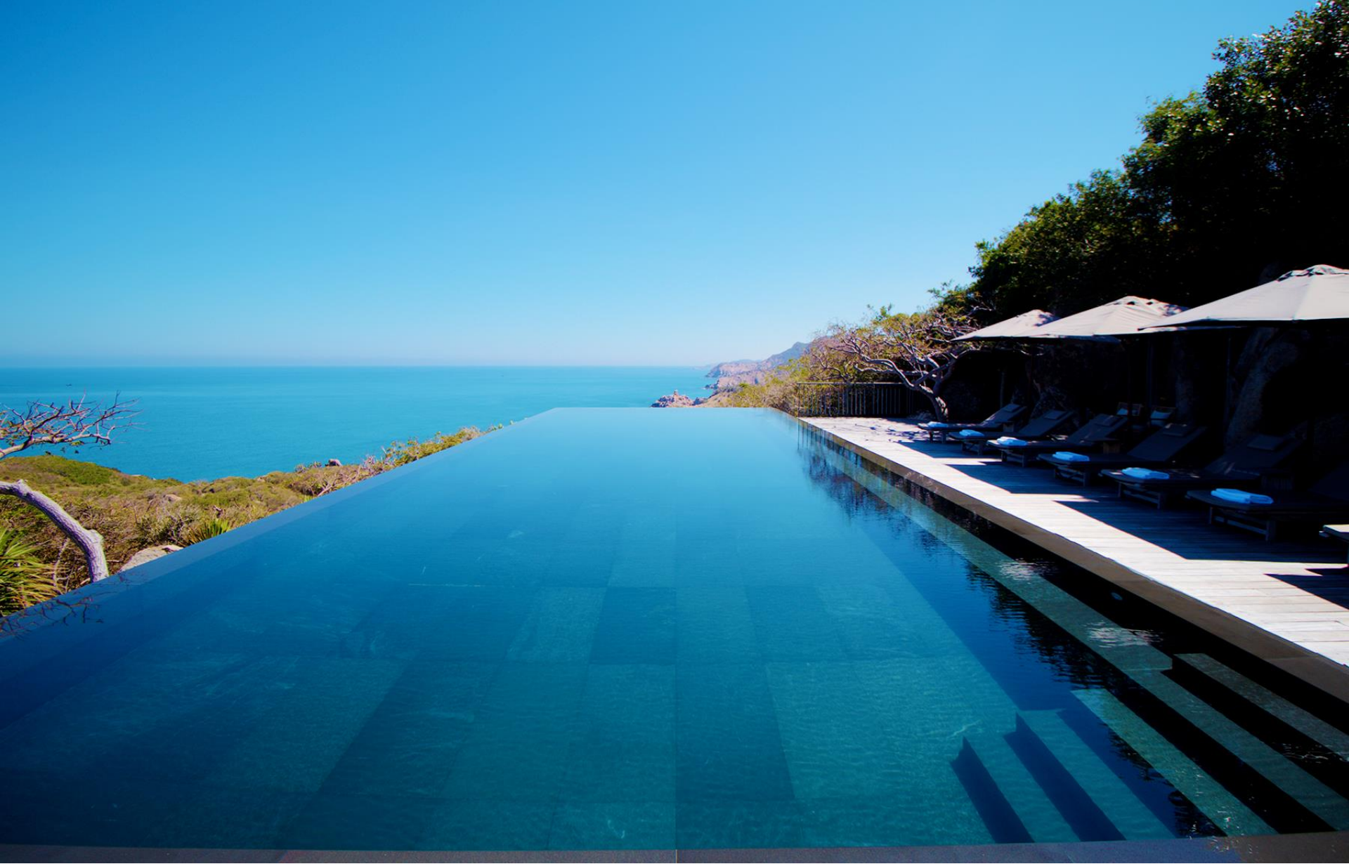
the Cliff Pool offer spectacular sea view