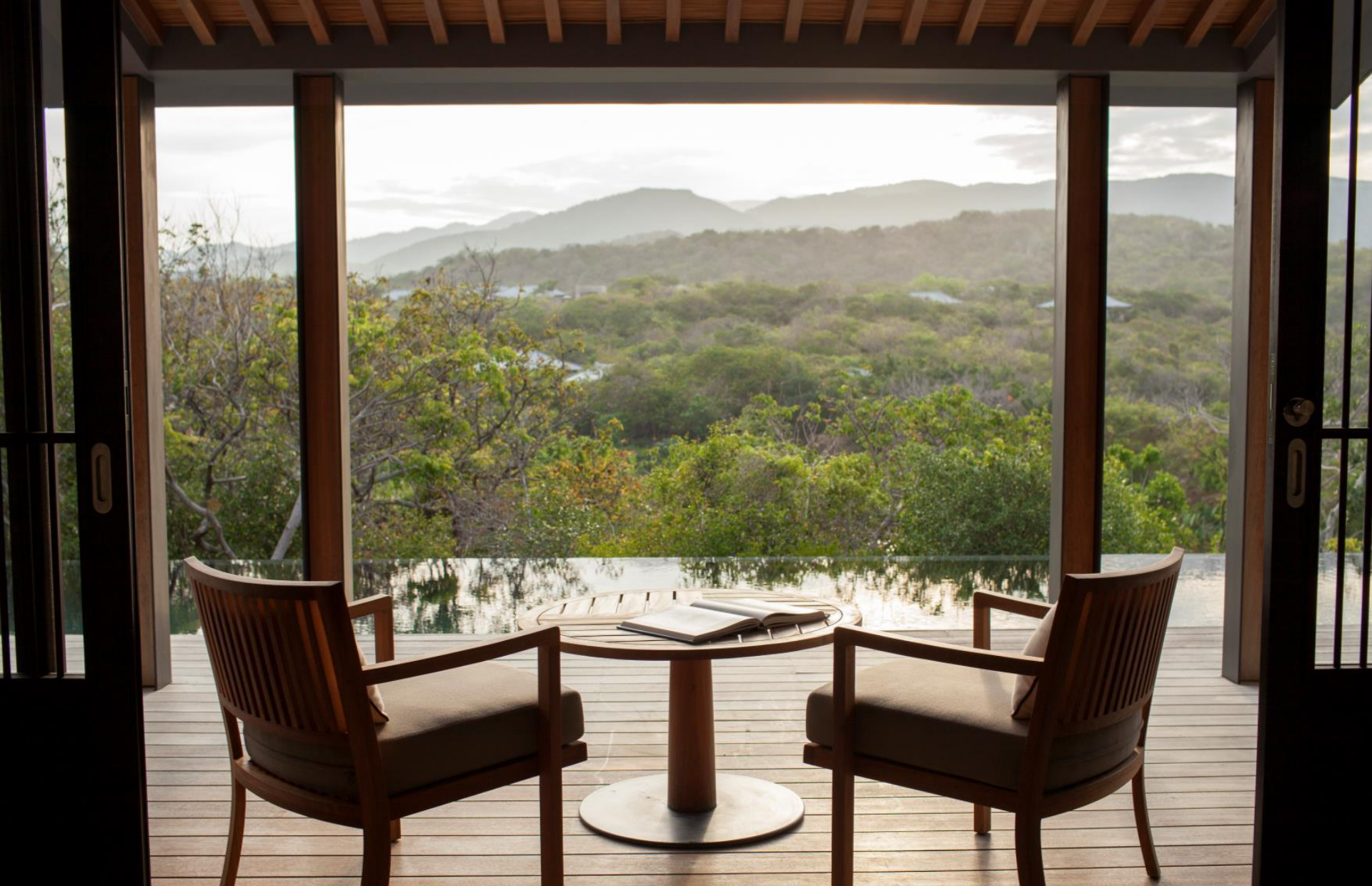
Mountain Pool VILLA