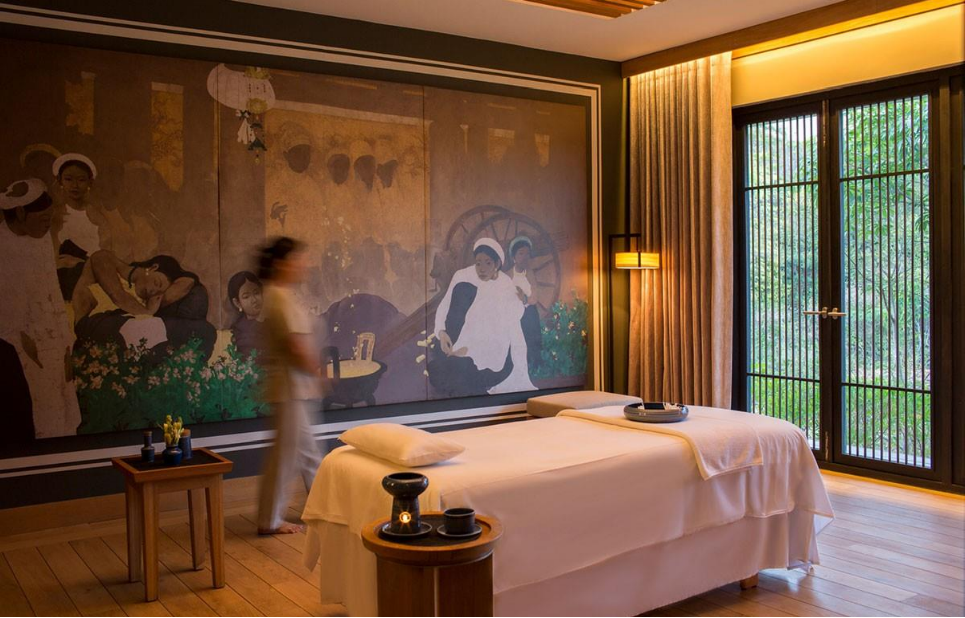
Five double treatment rooms