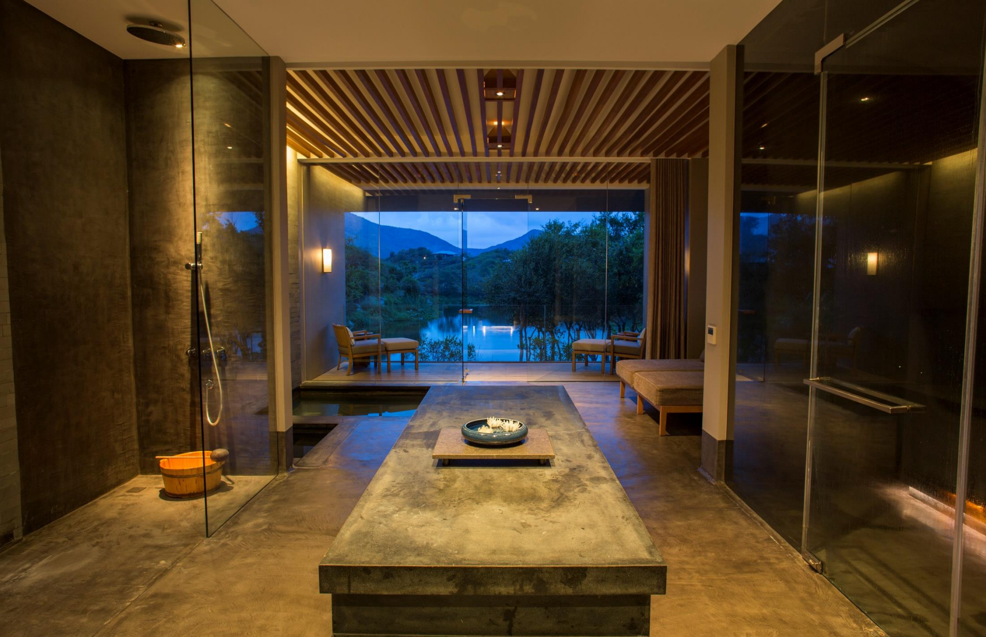
two hydrotherapy suites featuring a heated stone treatment table, steam room & Jacuzzi