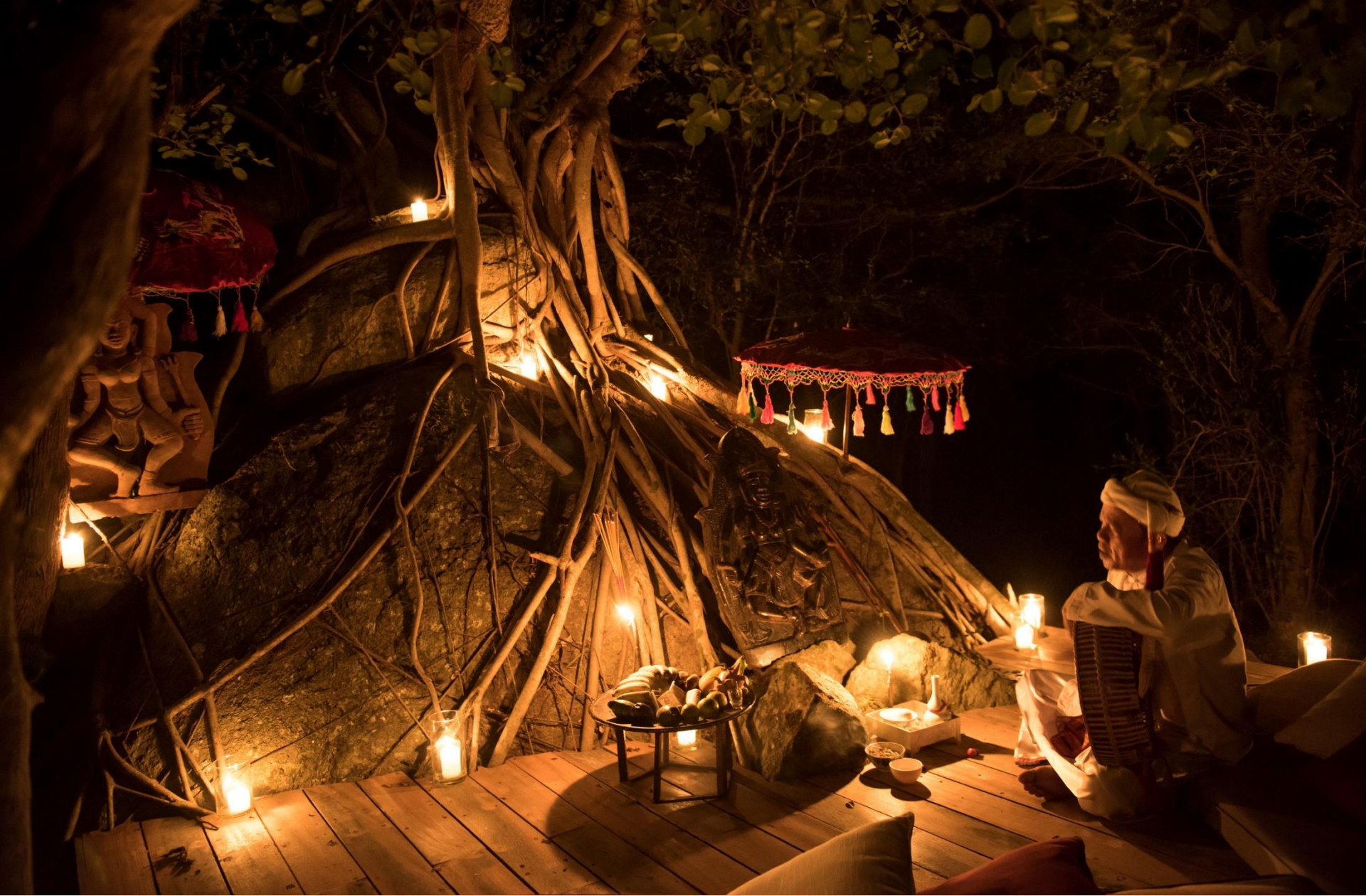
The Sacred Cham