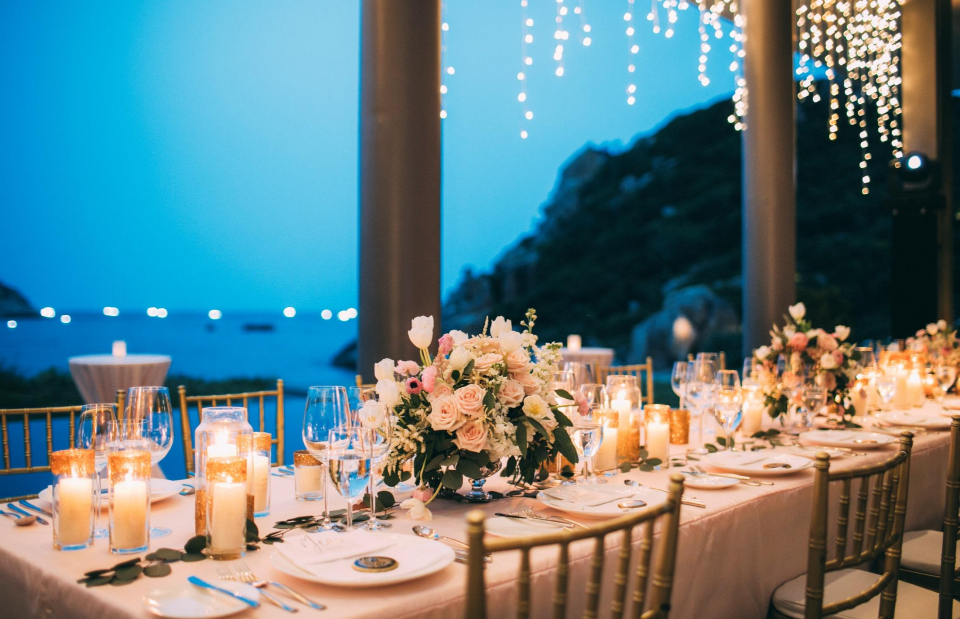
Wedding Reception at the Beach Club