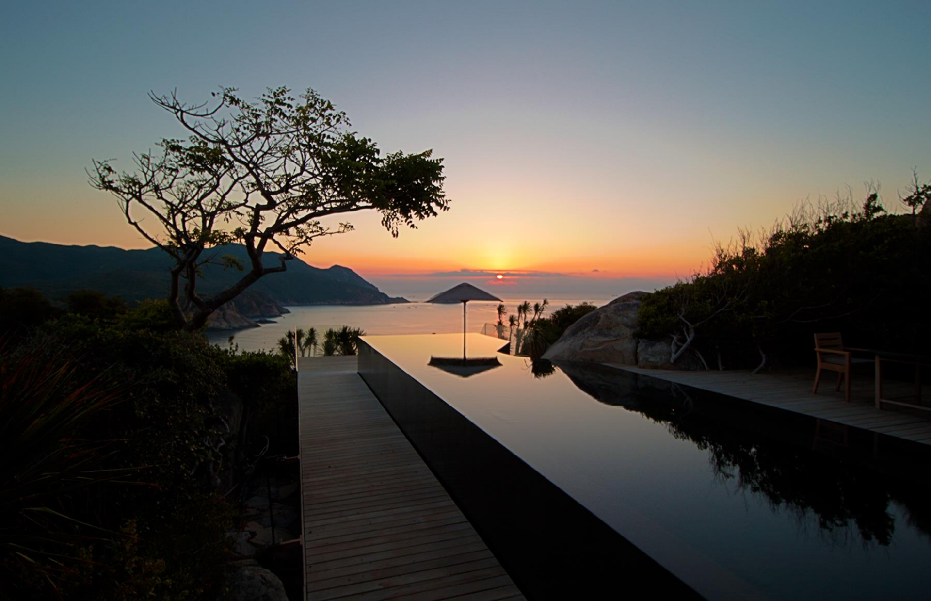
AMANOI Ocean Pool Villa