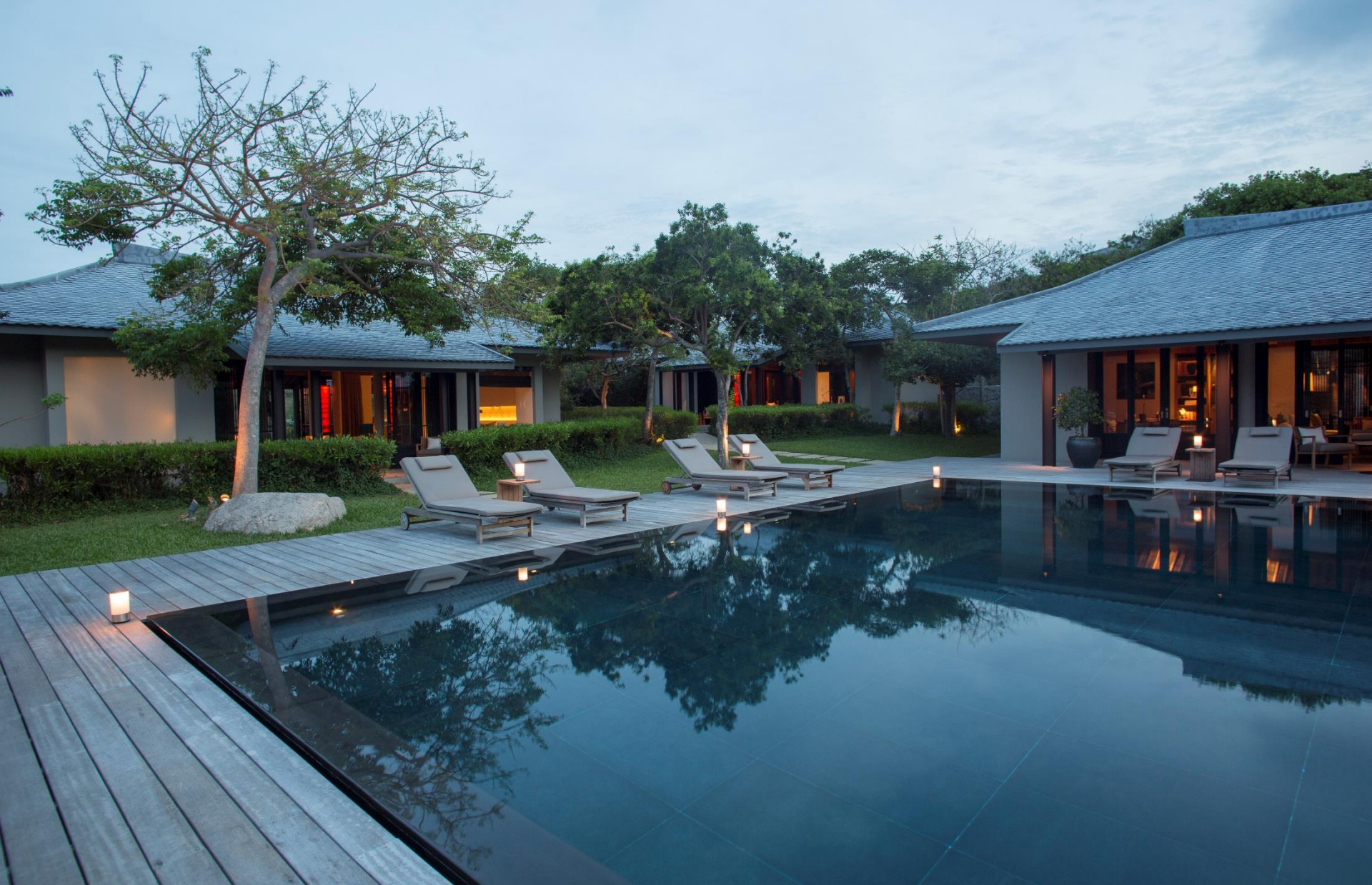
Aman RESIDENCE consists of two to five free-standing bedroom pavilions