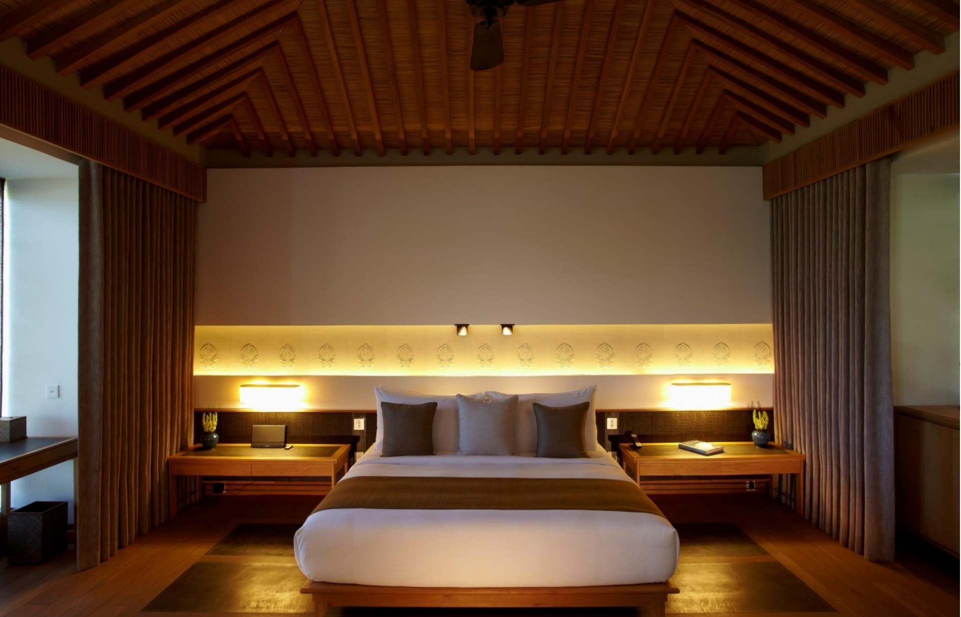
The design of the Pavilions fuses contemporary elegance with traditional Vietnamese architectural styles