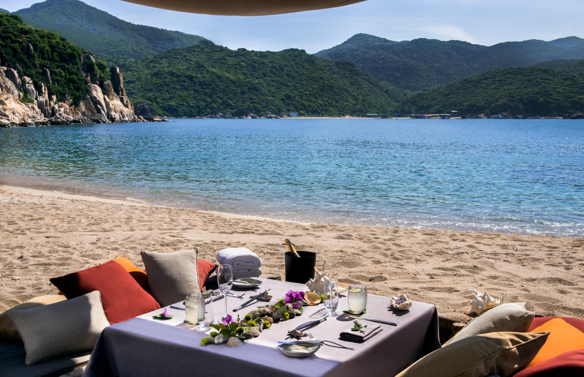
Beach Champagne Breakfast