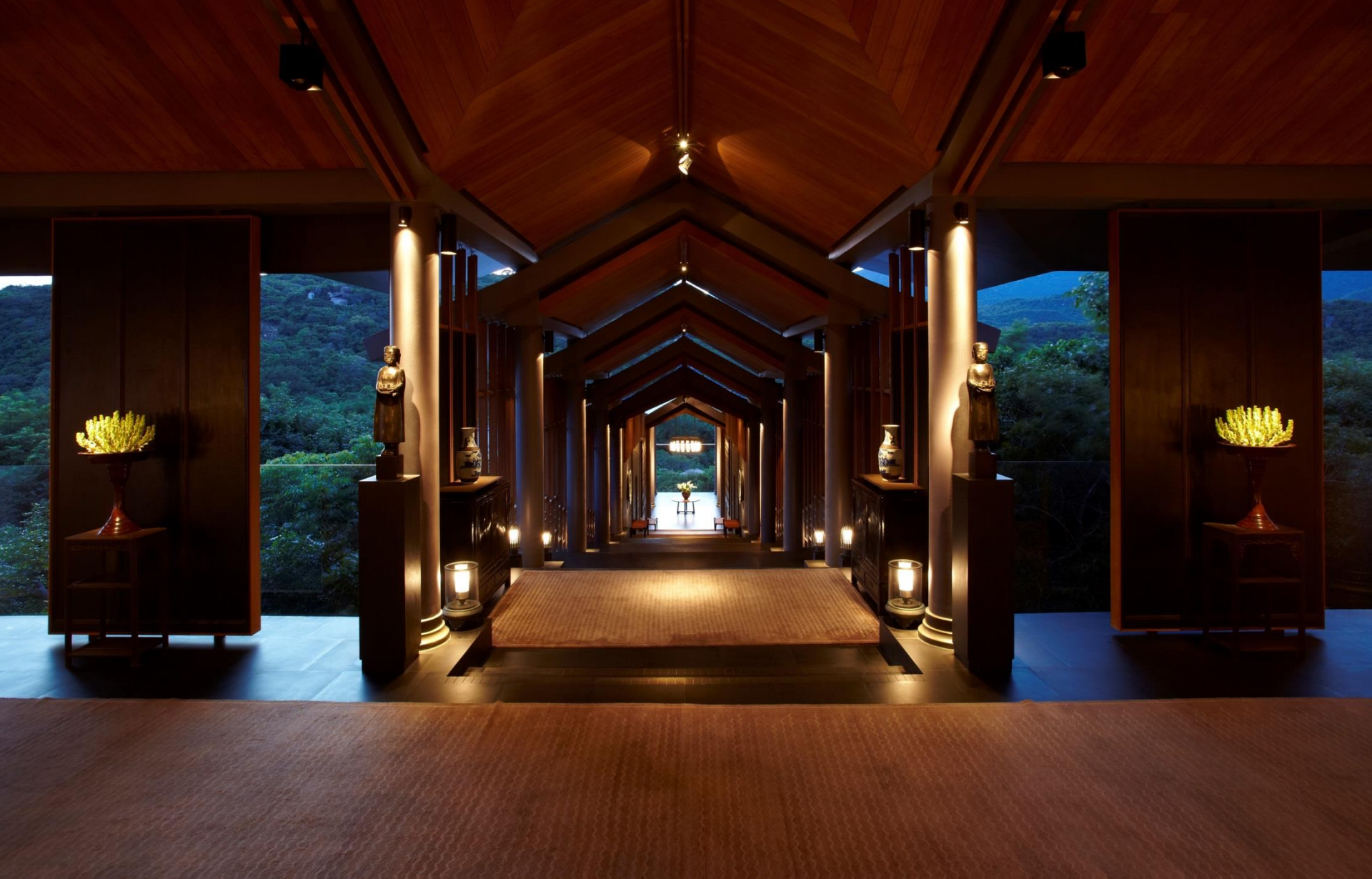
Majestic stairs that lead to the the Restaurant, Bar & Library