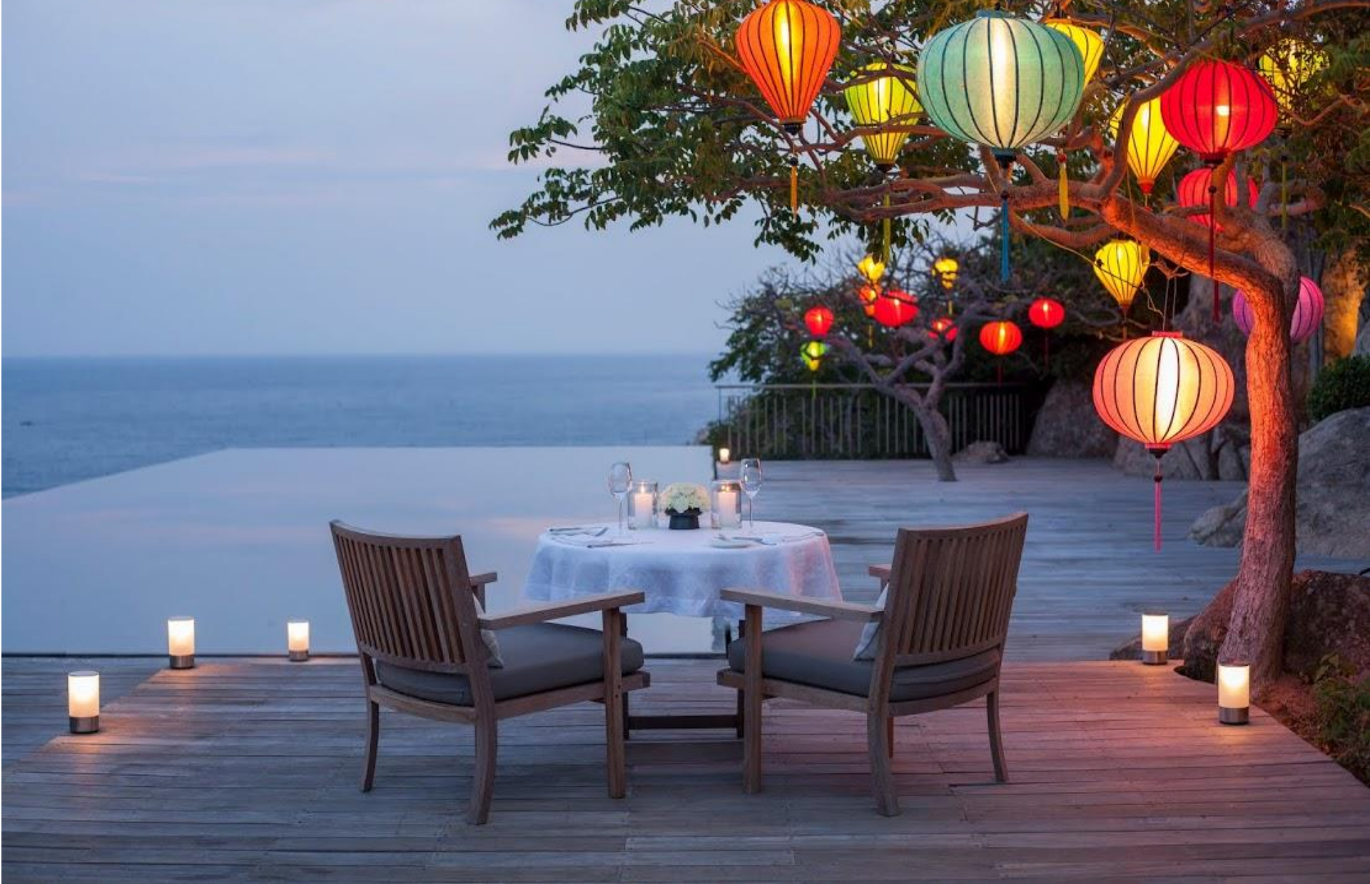
Private dinner by the cliff pool