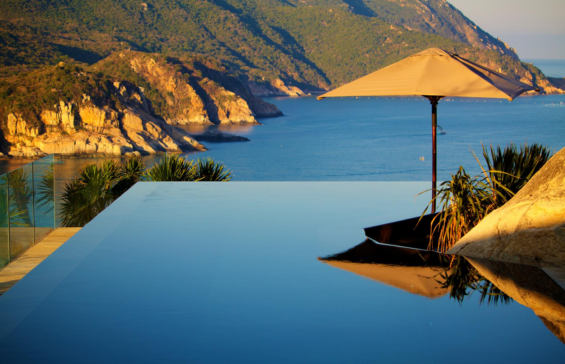
AMANOI Ocean Pool Villa