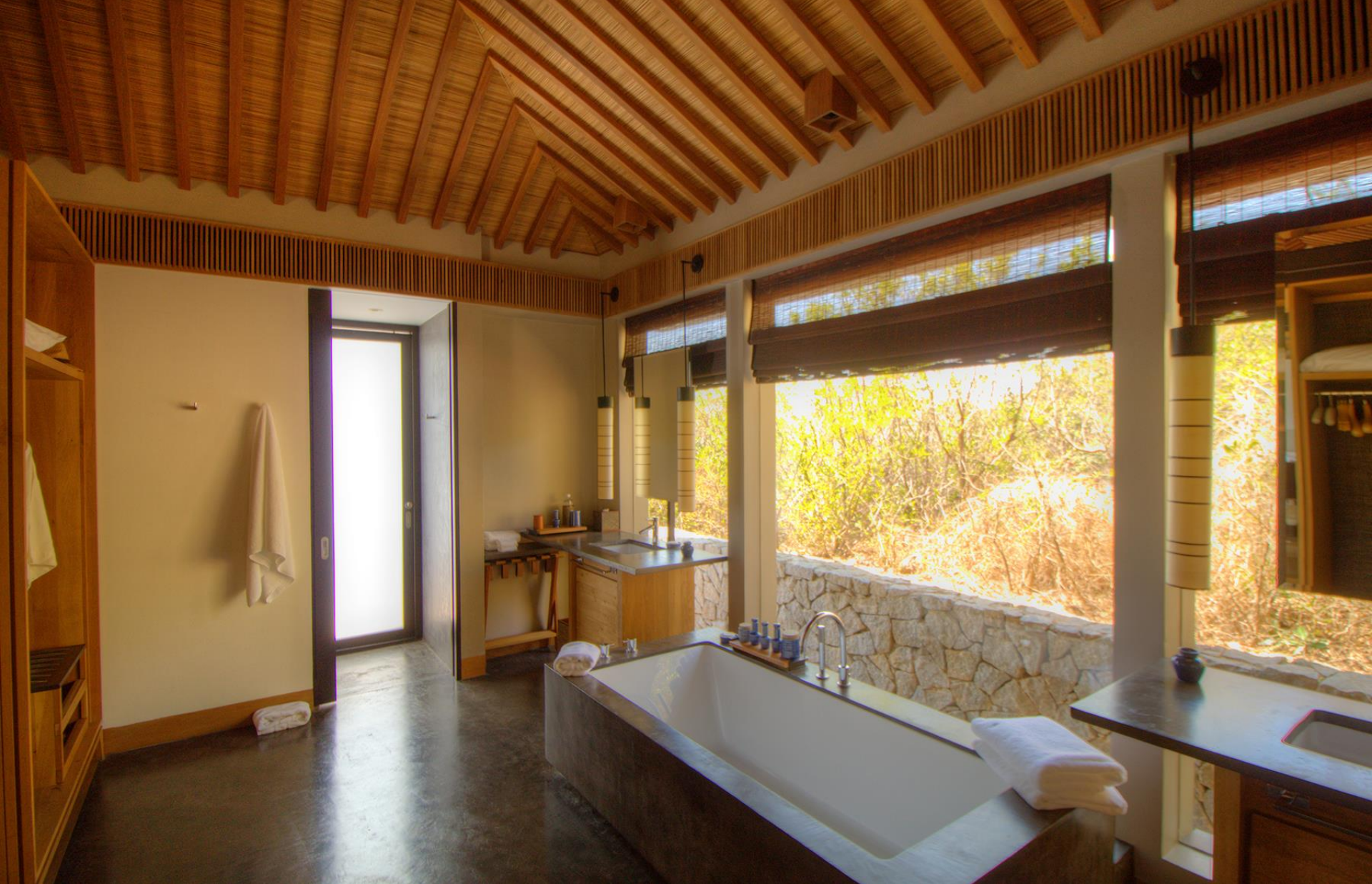
Double vanities bathroom