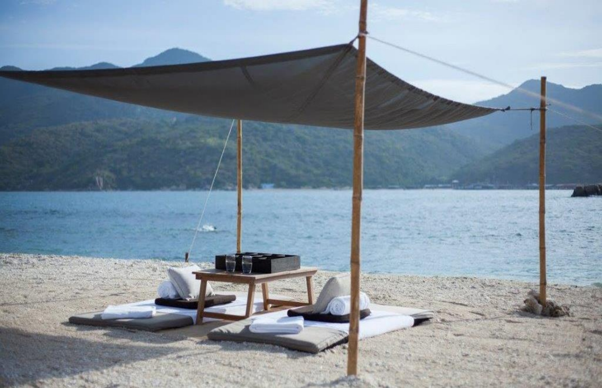
Picnic on a private beach