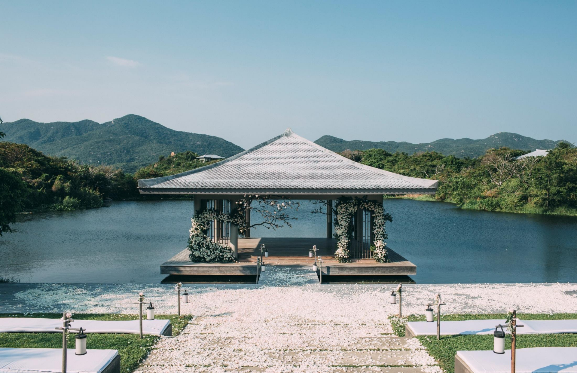
Wedding Ceremony at the Lake