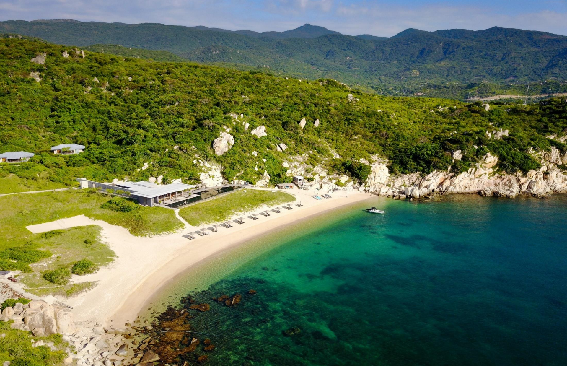
Private sandy beach