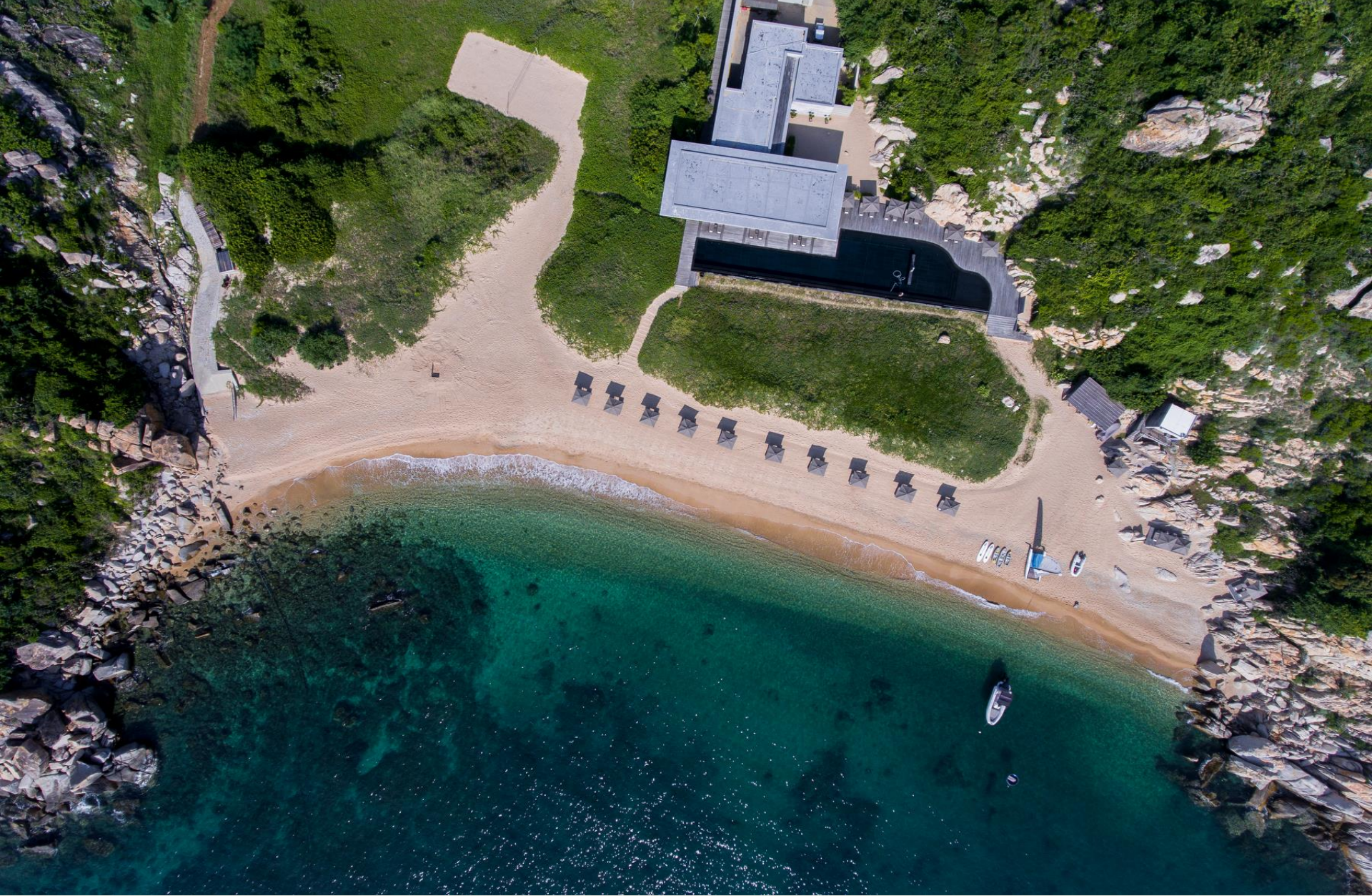
Aerial view to amanoi's private beach