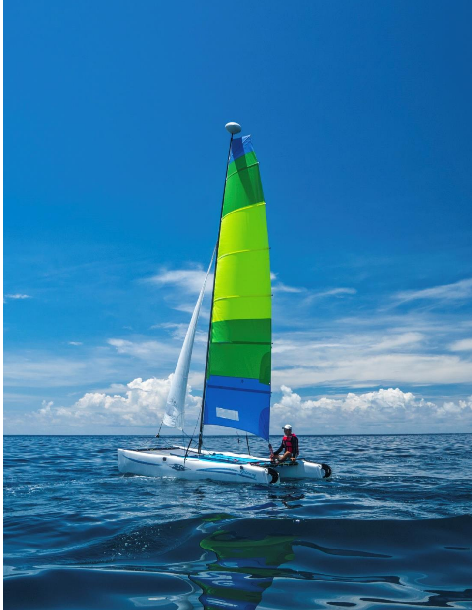
• HOBIE CAT