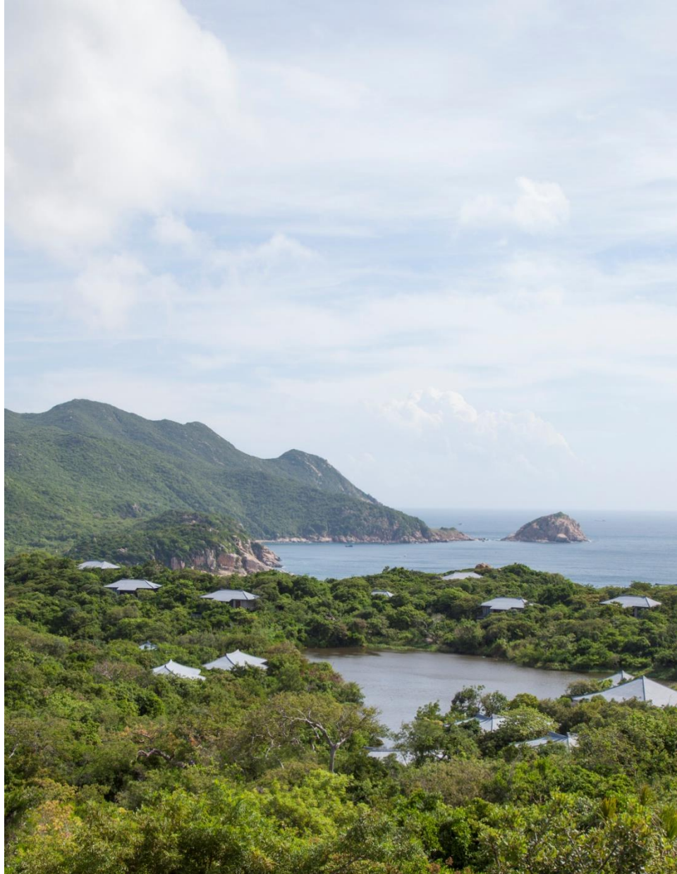
• NESTLED AROUND THE LAKE