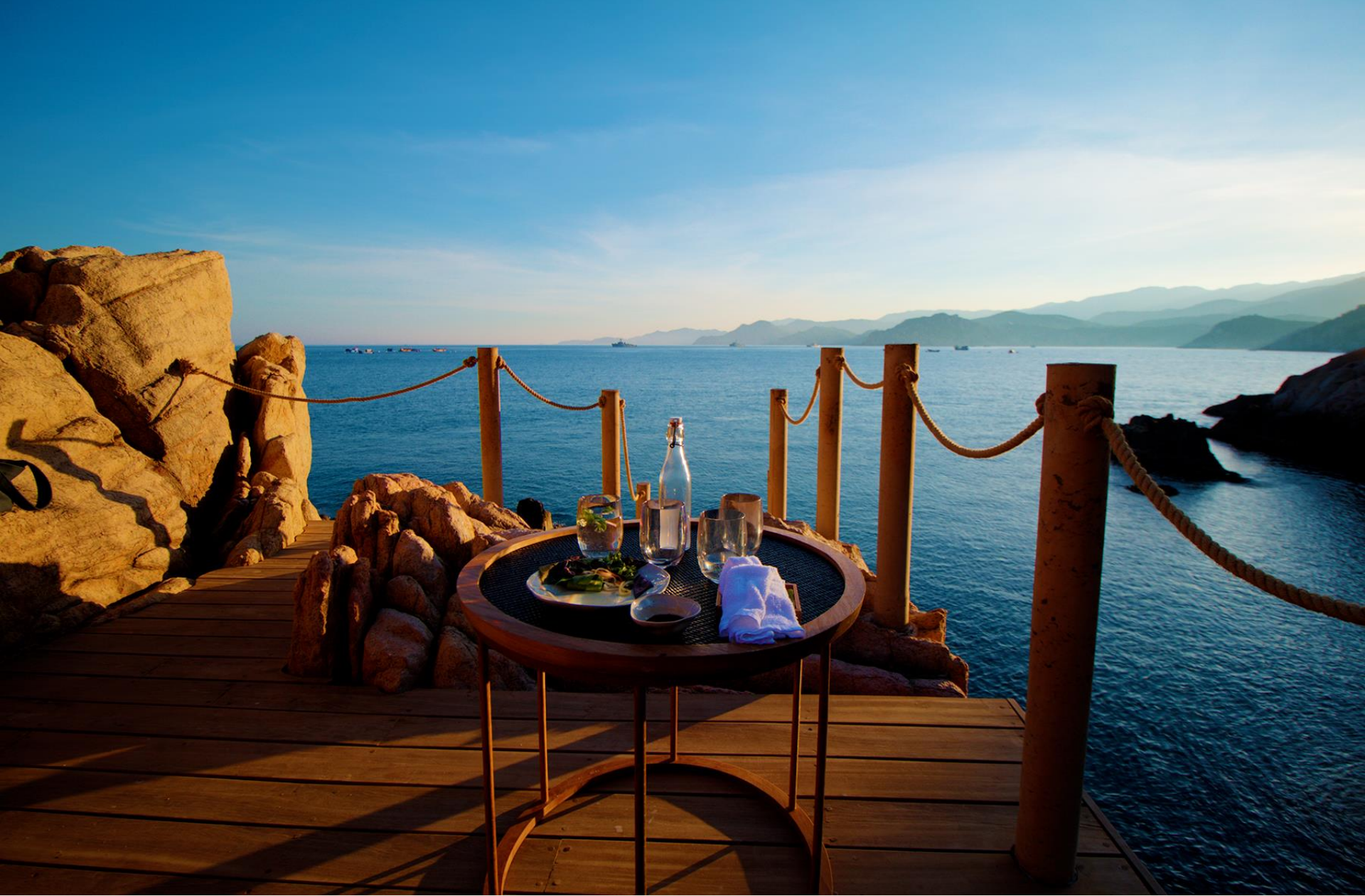
The Twilight Cliff Lounge