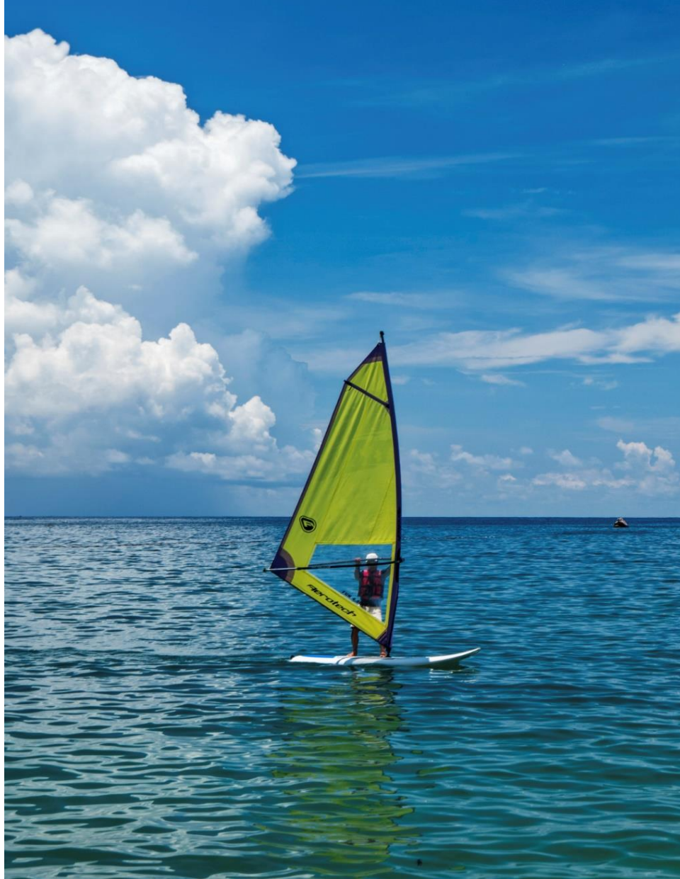
• WIND SURFING