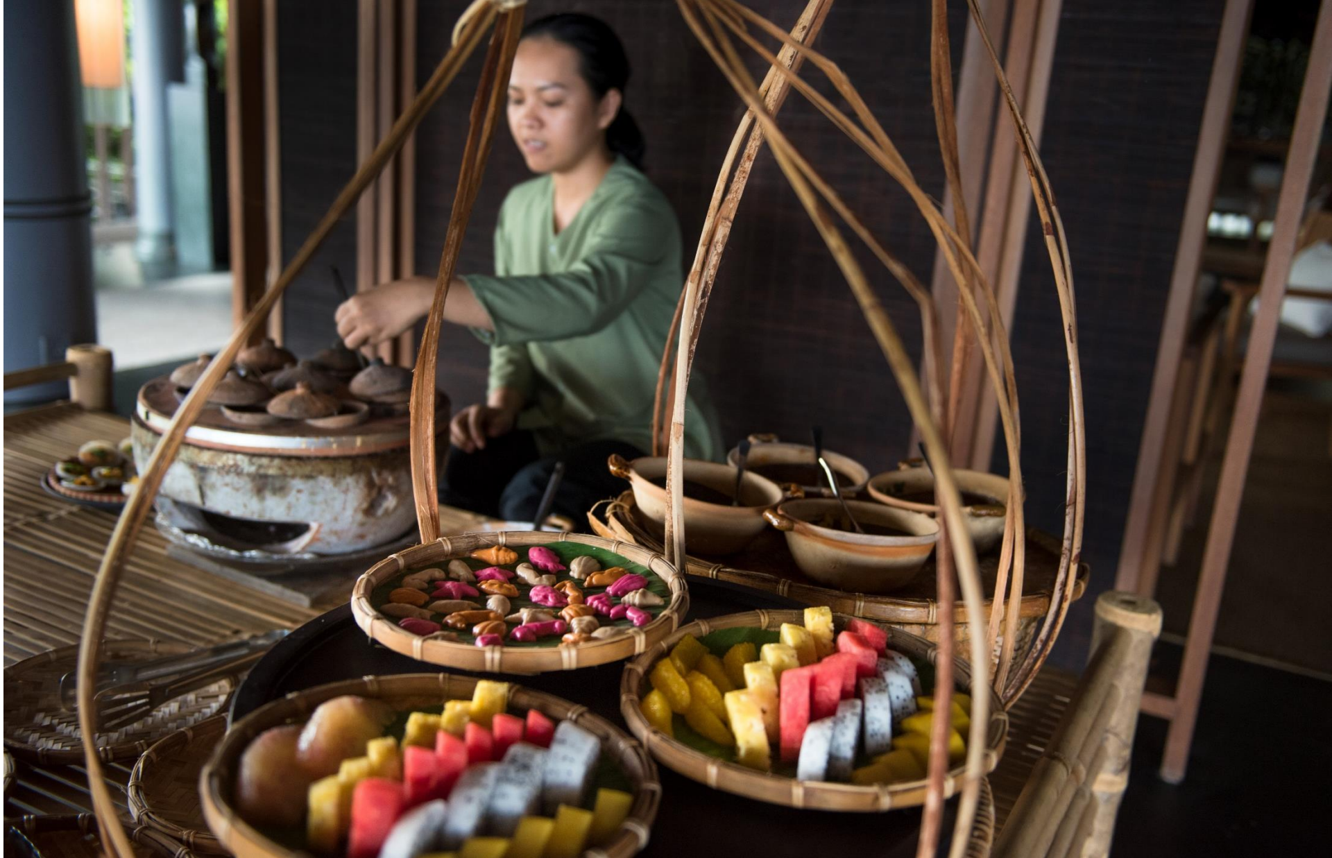
Afternoon tea with local delicacies