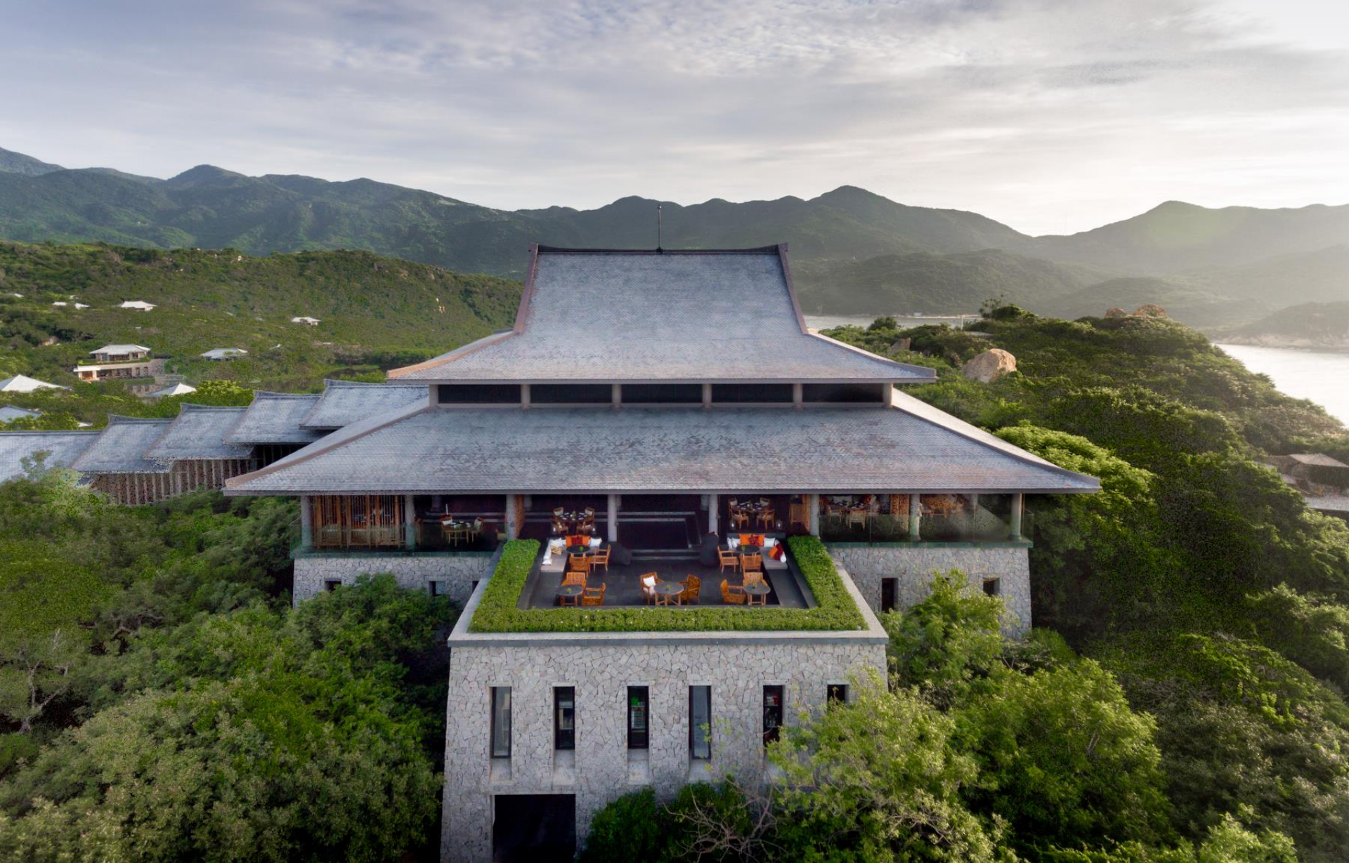
the Central Pavilion occupies the hilltop and houses the Restaurant, Bar & Library