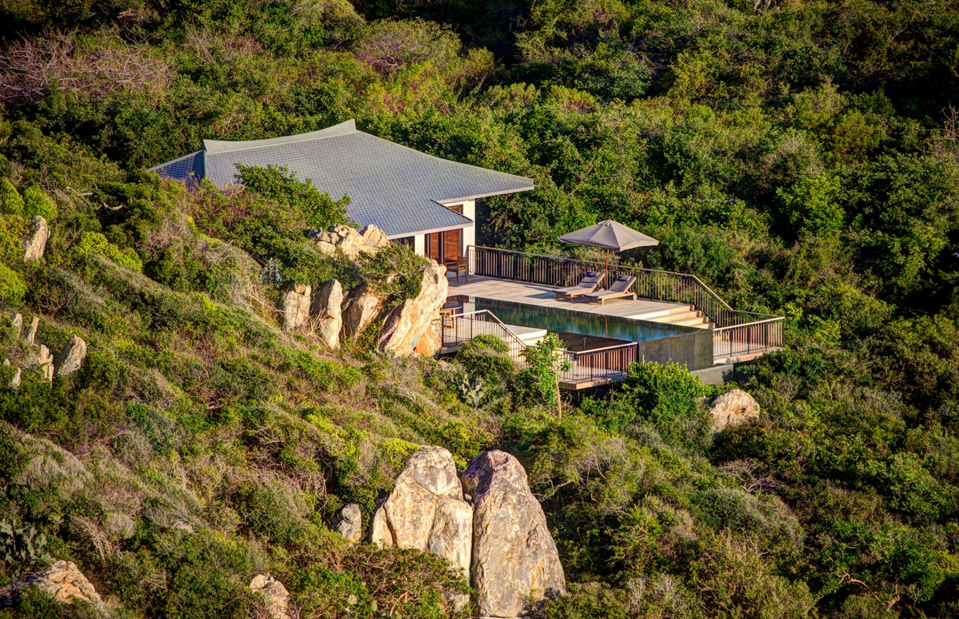
AMANOI Ocean Pool Villa