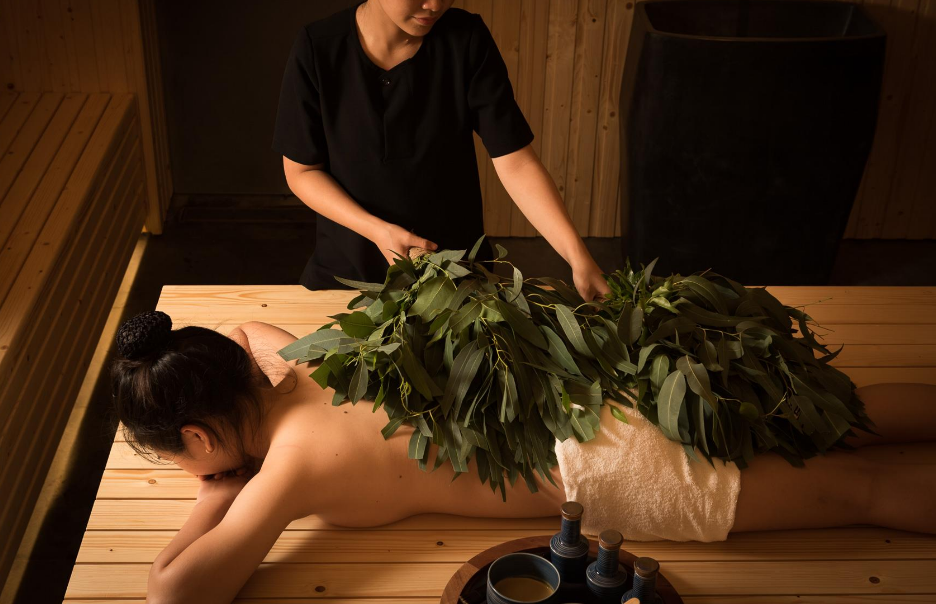
Banya or hammam treatment is offer at each spa house