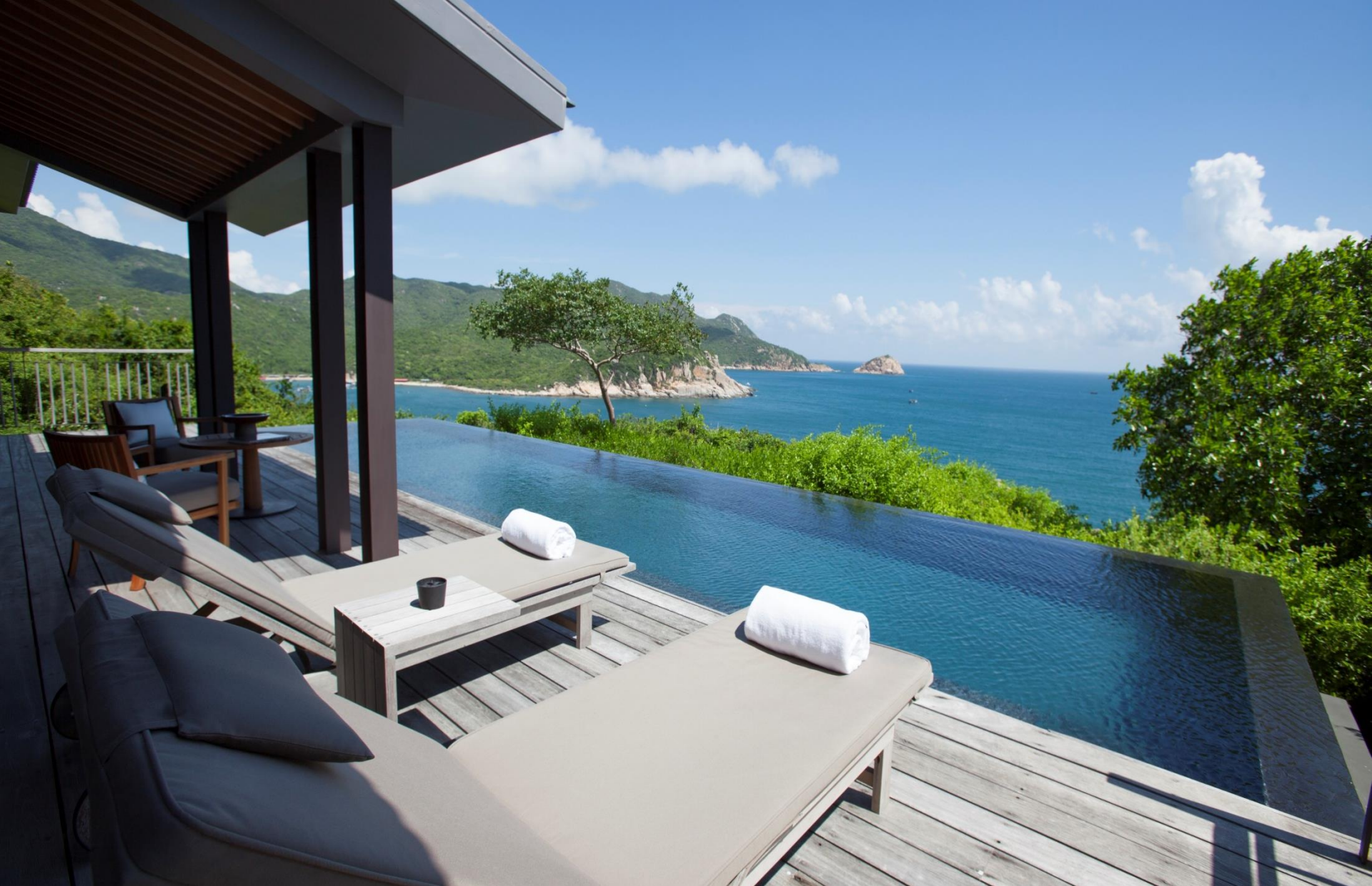
Ocean Pool Villa