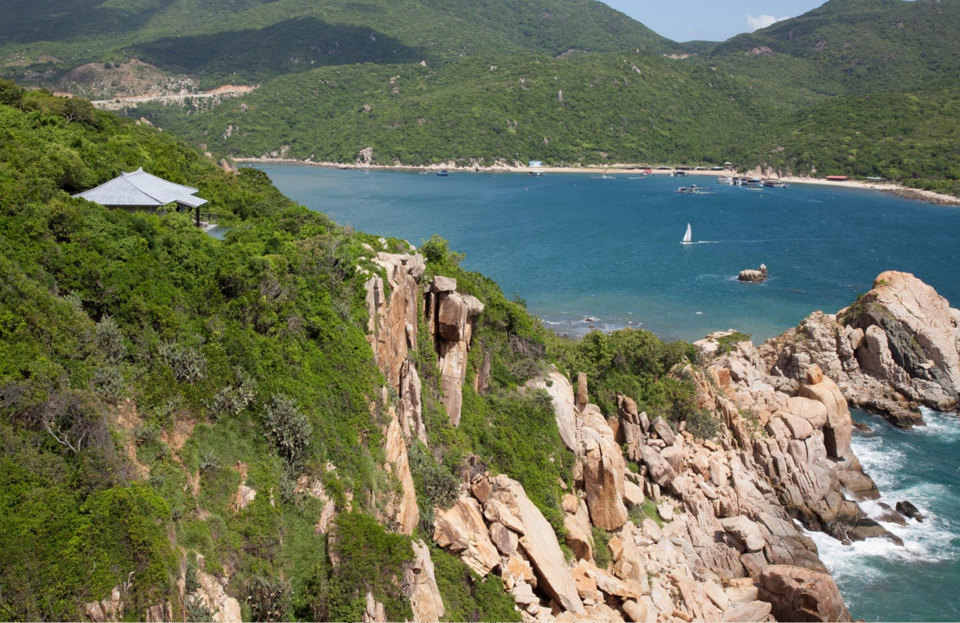
Pavilions are positioned on the hillside with impressive views