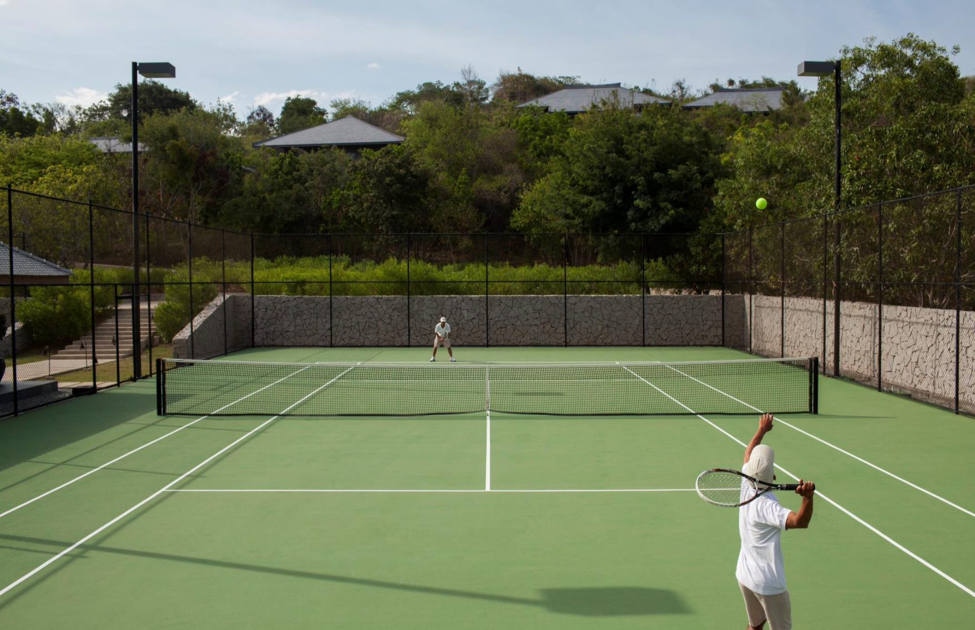
Two tennis courts