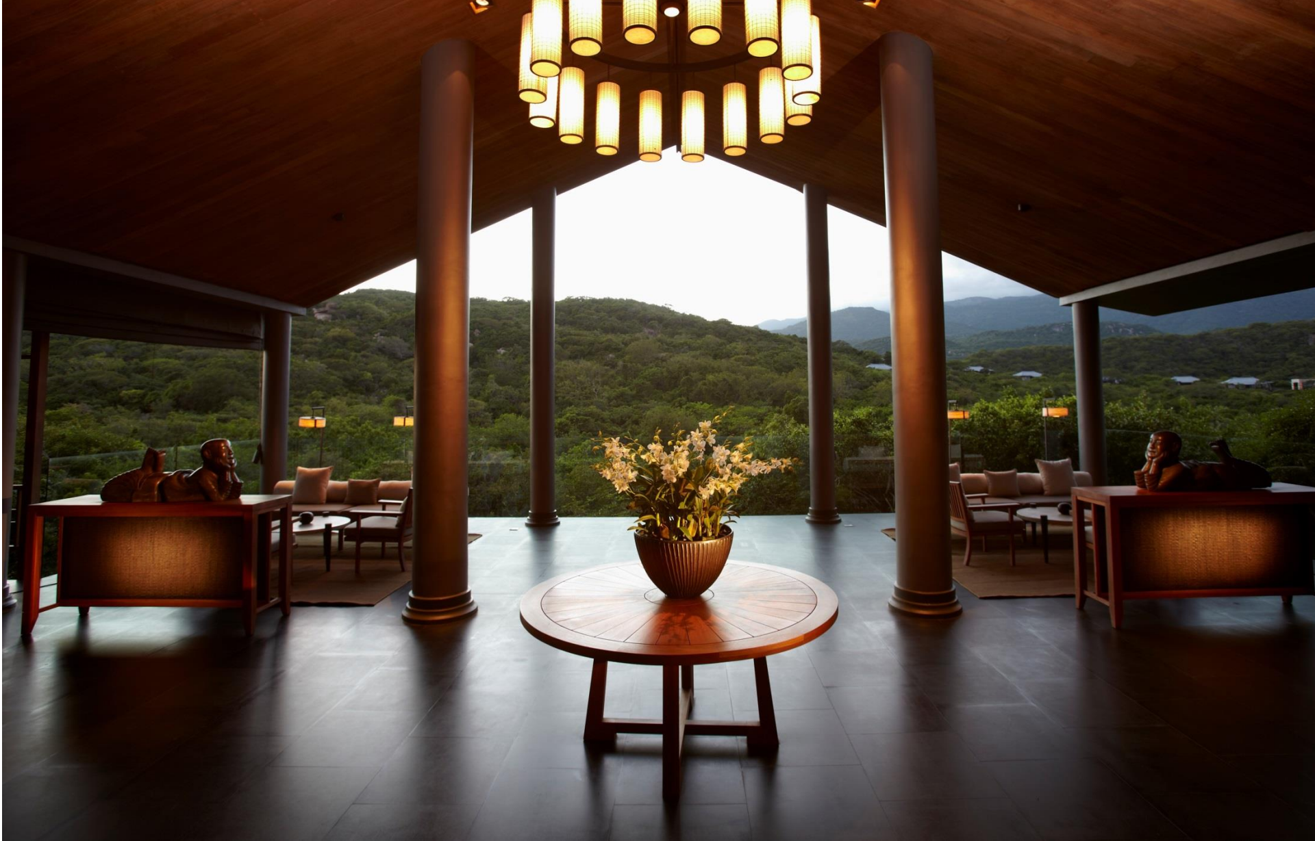
the Central Pavilion occupies the hilltop and houses the Restaurant, Bar & Library