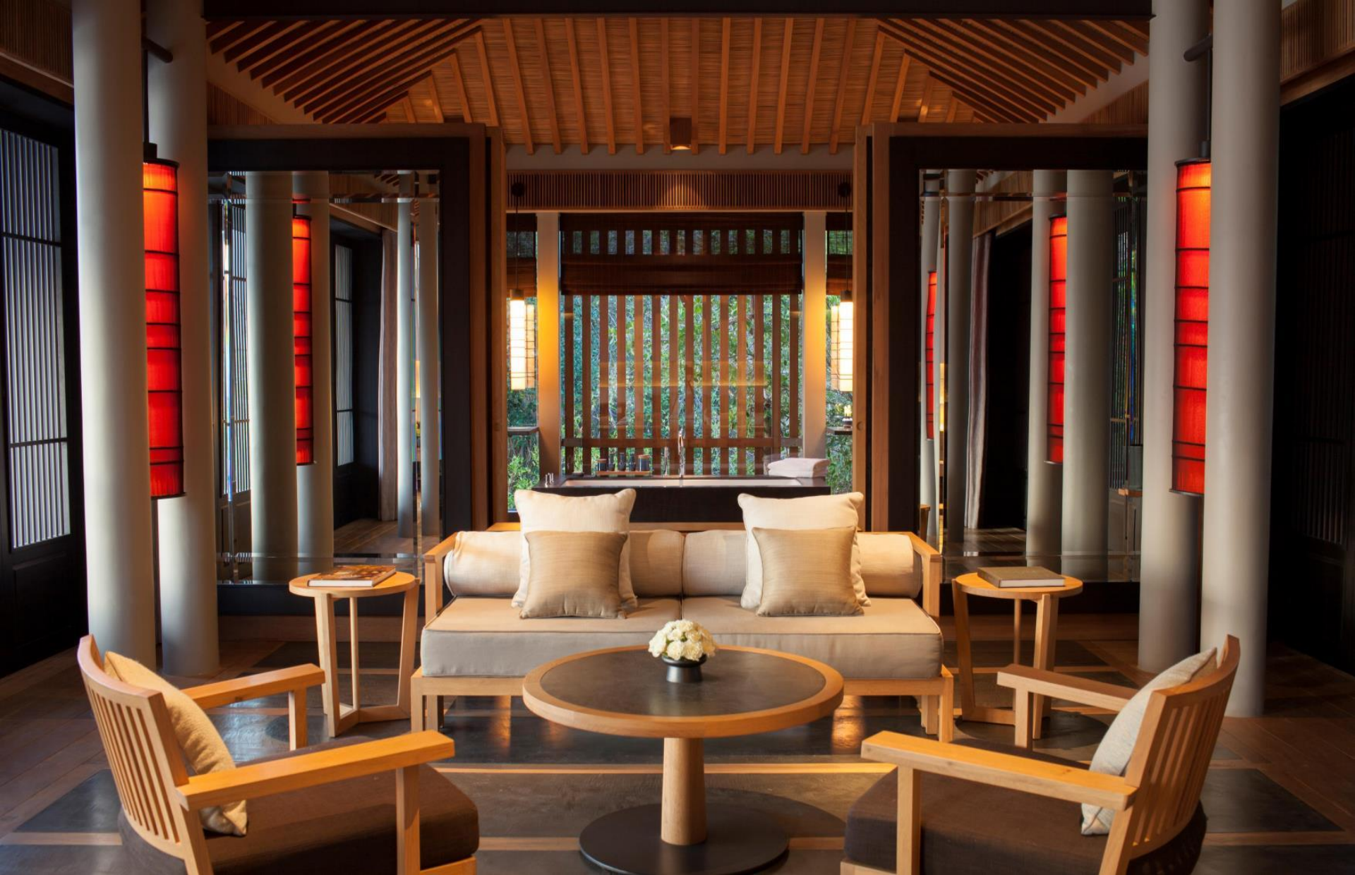
Pavilions are identical in layout and design