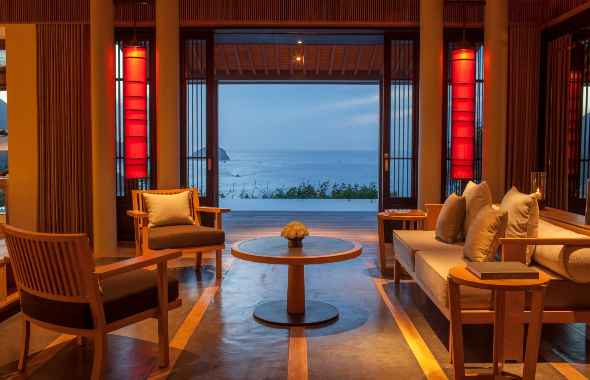
Ocean Pool Villa